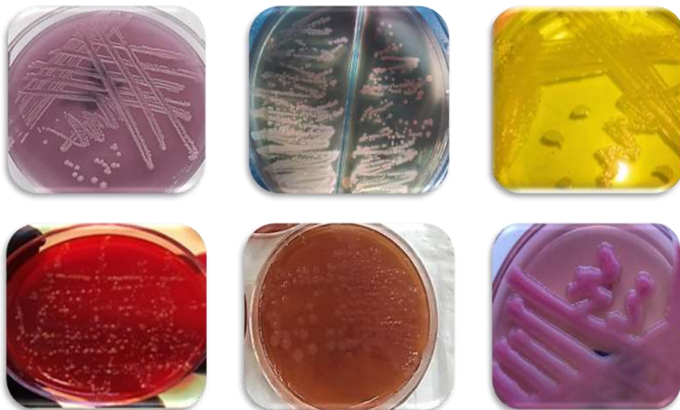
Figure 3. Different bacterial types on different culture media. A and B: E. coli on MacConkey agar. C: S. aureus on Mannitol salt agar. D: S. mutans on Blood agar. E and F: K. pneumoniae on MacConkey agar.