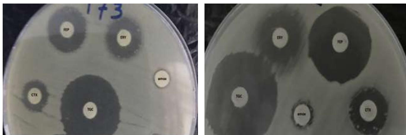
Figure 4. Results of antibiotic susceptibility test shows the inhibition zones of used antibiotics including: FEP, ERY, amox, CTX and TGC against some bacterial isolates under study.

*S= Sensitive, K. pneumoniae = Klebsiella pneumoniae , E. coli = Escherichia coli .